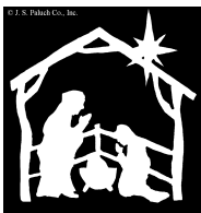
© J. S. Palach Co., Inc.